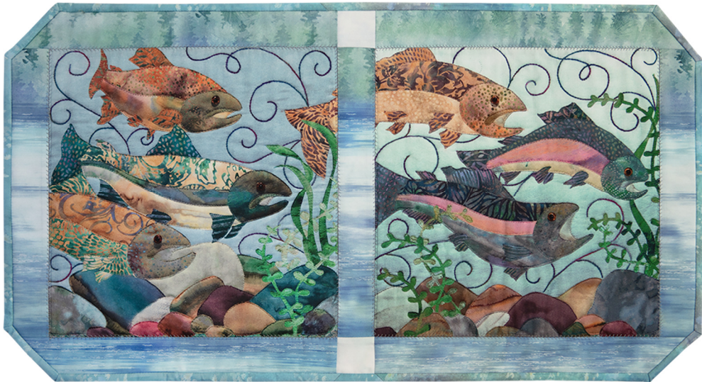
OUT08-P Rock Bottom