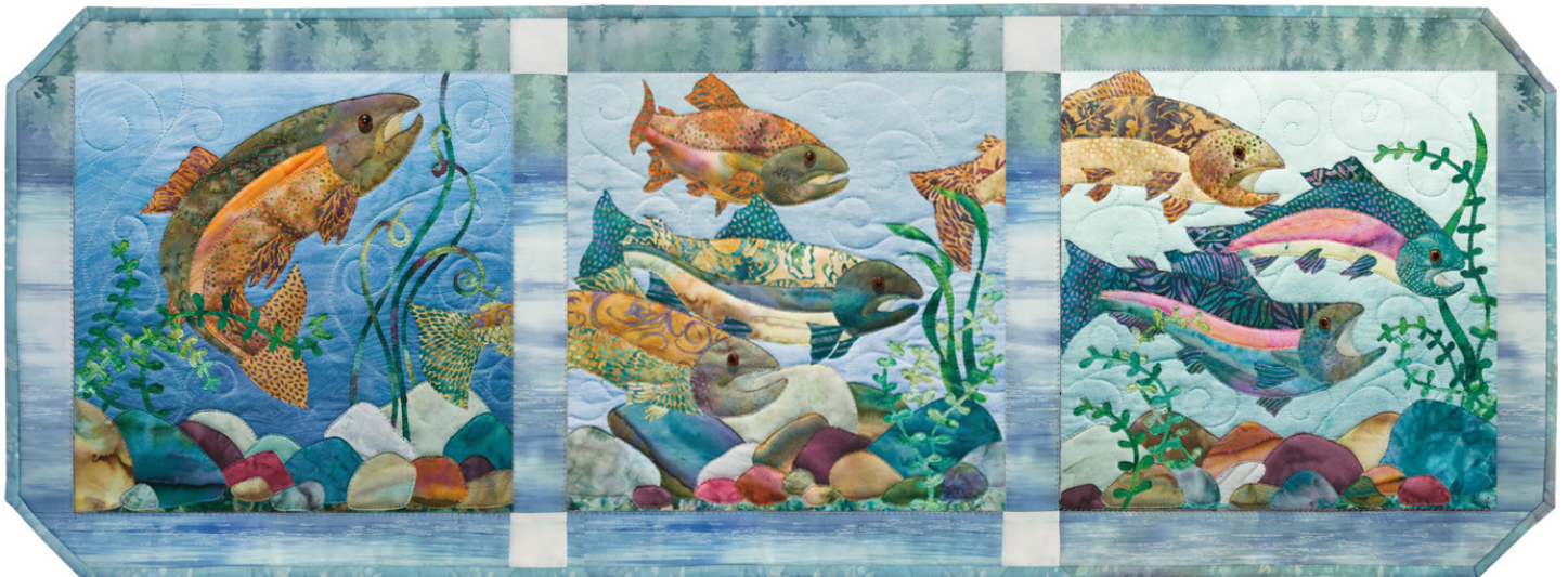
OUT07-P Heads or Tales?